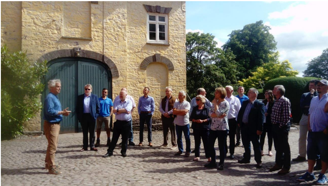
Members visiting Penpont near Brecon on a Climate Change Day in 2019