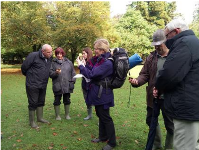
Former Members learning how the Education team uses GPS with school

The Authority delegates responsibility for day to day decision-making to its staff. There are clear guidelines on which decisions officers can make and which need to be decided by Members. This system ensures effective decision making at all levels of the organisation. The committee structure is shown at Annex 2 .